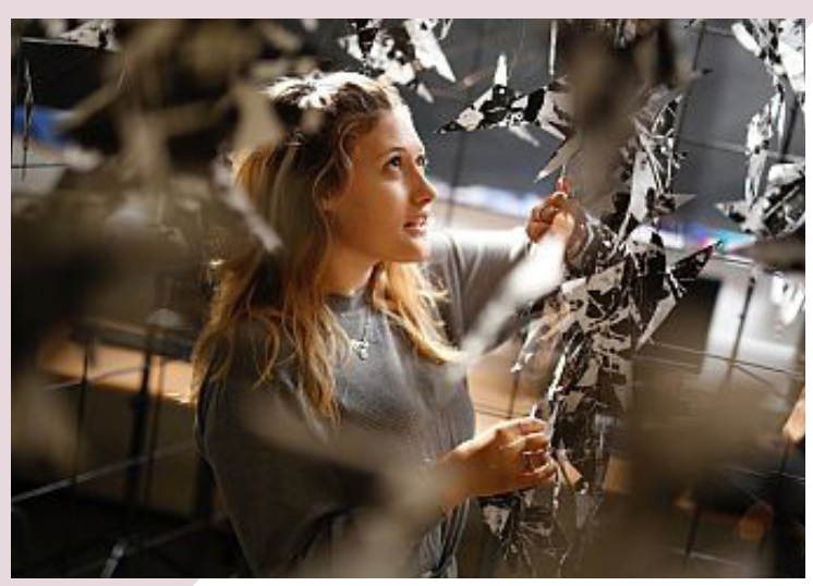
Setting up for the Annual Art and Photography Exhibition

Based in the same town as Hauser & Wirth Somerset, Sexey's benefits hugely from close ties with the international art gallery.