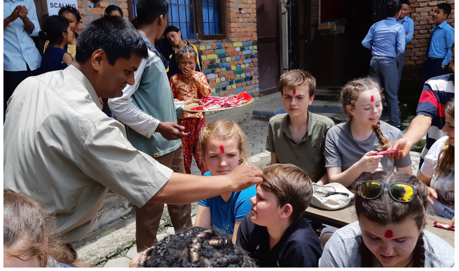
School trip to Nepal